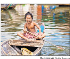
HADYVAH Getty Images