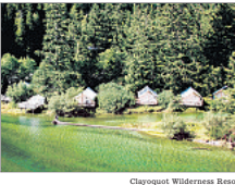
Clayoquot Wilderness Resort