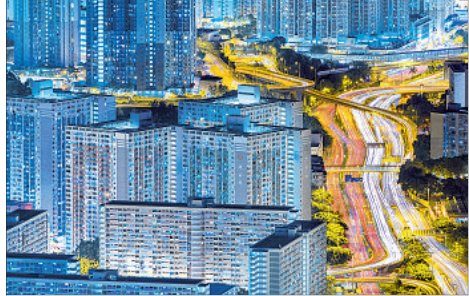
RATNAKORN PIVASIRISOROP Getty Images