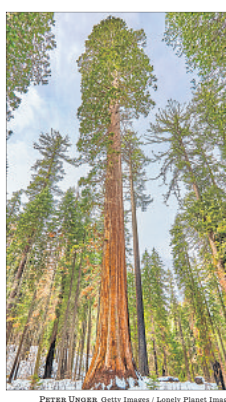
PETER UNOHA Getty Images / Lonely Planet Image