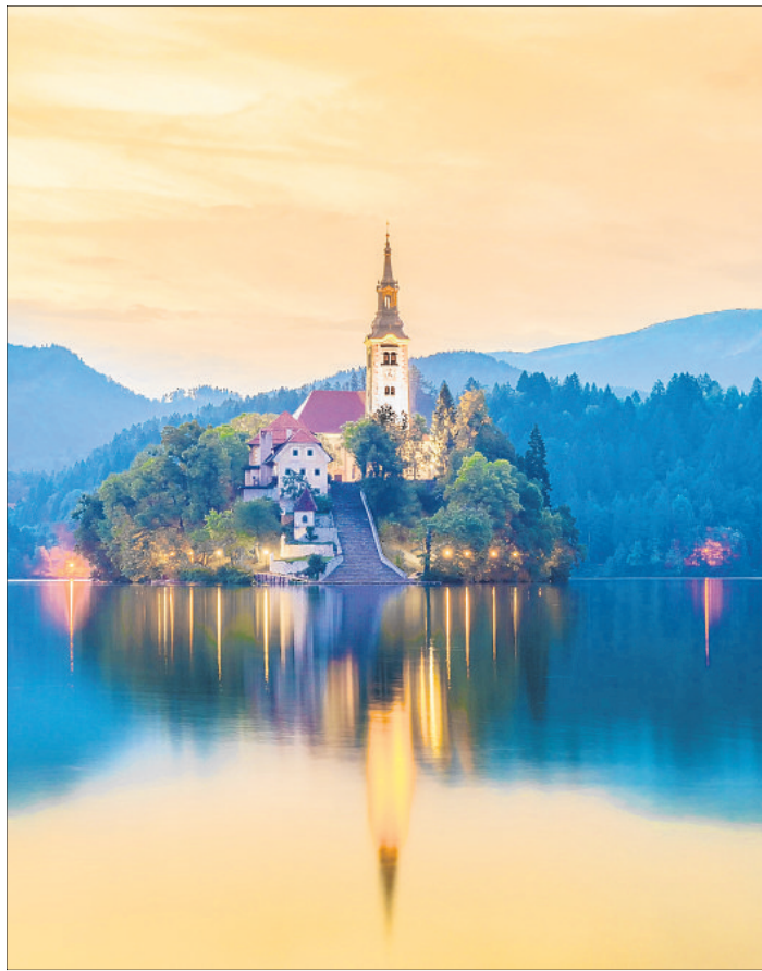
ALAN COOPER Getty Images / AWL Images BM

christopher.reynolds@latimes.com Twitter: @mrcsreynolds